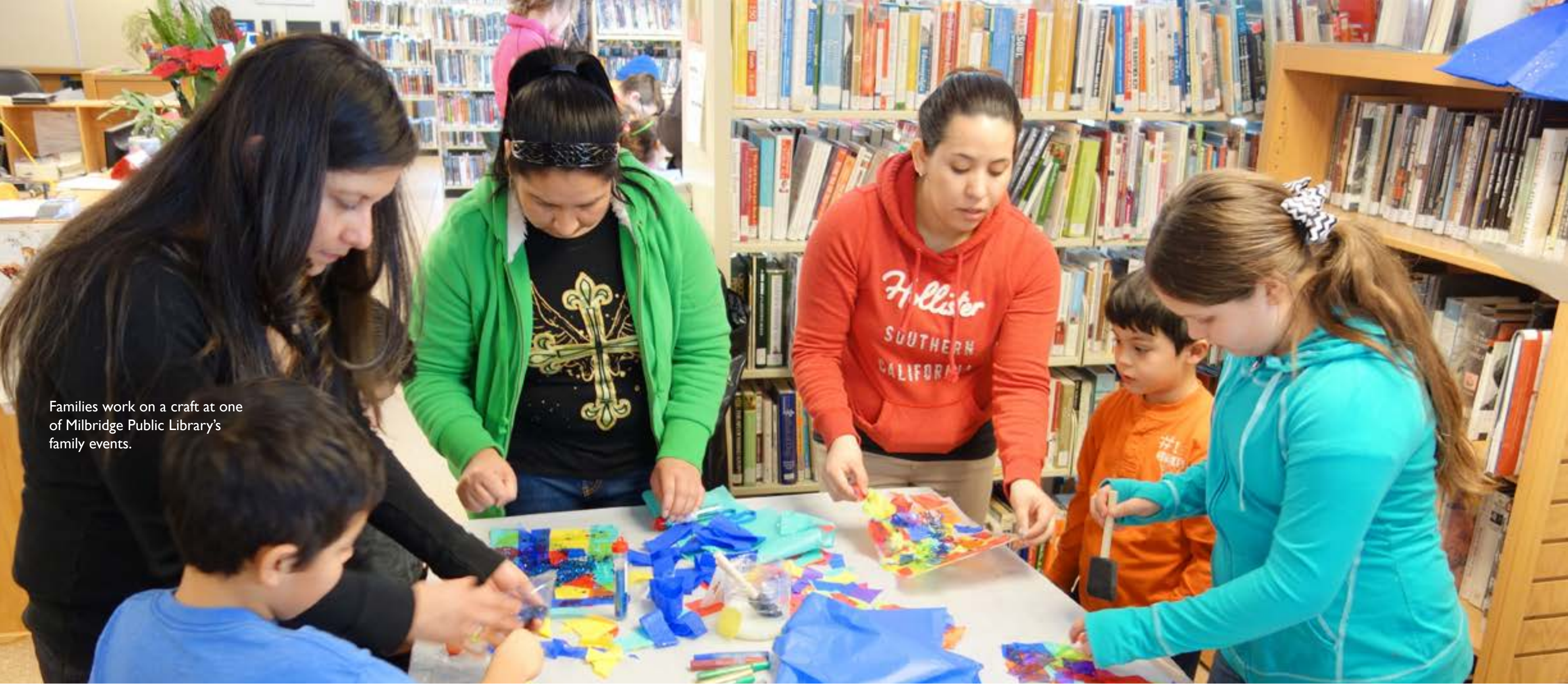
Families work on a craft at one of Milbridge Public Library's family events.