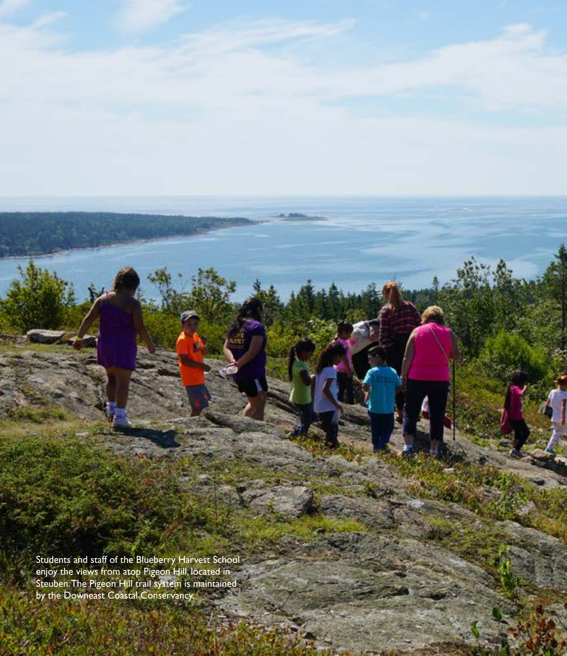
Students and staff of the Blueberry Harvest School enjoy the views from atop Pigeon Hill, located in Steuben. The Pigeon Hill trail system is maintained by the Downeast Coastal Conservancy.