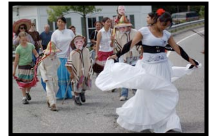
MILBRIDGE DAYS PARADE, JULY 2009